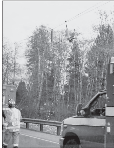
Broken insulators mark the spot where a destroyed transmission pole stood.

Lasting just millionths of a second, the surge in voltage, which was many times the normal voltage transmitted into homes, damaged customer appliances and electrical devices, including heat pumps, televisions, stoves and PUD-issued meters. The entire PUD meter department, and two line department servicemen, worked overnight over a two-day period to replace burned up meters to restore power to the area. There is no charge to the ratepayer to replace a meter damaged from a power surge.